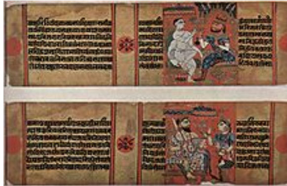
White-clothed Acharya Kalaka

Other austerities include meditation in seated or standing posture near river banks in the cold wind or meditation atop hills and mountains, especially at noon when the sun is at its fiercest. Such austerities are undertaken according to the physical and mental limits of the individual ascetic. Jain ascetics are (almost) completely without possessions. Some Jains (Shvetambara monks and nuns) own only unstitched white robes (an upper and lower garment) and a bowl used for eating and collecting alms. Male Digambara monks do not wear any clothes and carry nothing with them except a soft broom made of shed peacock feathers ( pinchi ) and eat from their hands. They sleep on the floor without blankets and sit on special wooden platforms. Every day is spent either in study of scriptures or meditation or teaching to lay people. They stand aloof from worldly matters. When death is imminent or when a monk feels that he is unable to adhere to his vows due to advanced age or terminal disease, many Jain ascetics take a final vow of Santhara or Sallekhana , a peaceful and detached death where medicines, food and water are abandoned.